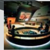
Australian Centre for the Moving Image