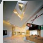
The Ian Potter Centre NGV Australia