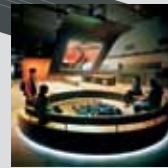
Australian Centre for the Moving Image