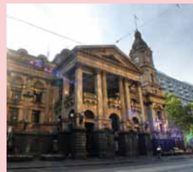
Melbourne Town Hall

For chocolate lovers, a stop at either Koko Black or Haigh's is a must on the way to the Gold Treasury Museum (16) at the