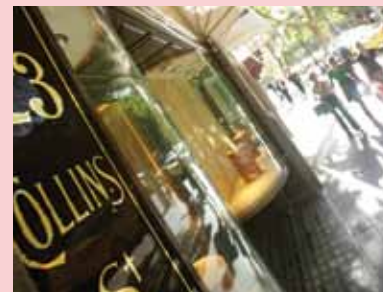
Beautiful Collins Street