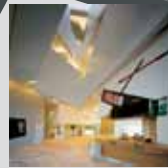
The Ian Potter Centre NGV Australia