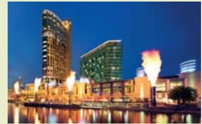
Crown Entertainment Complex