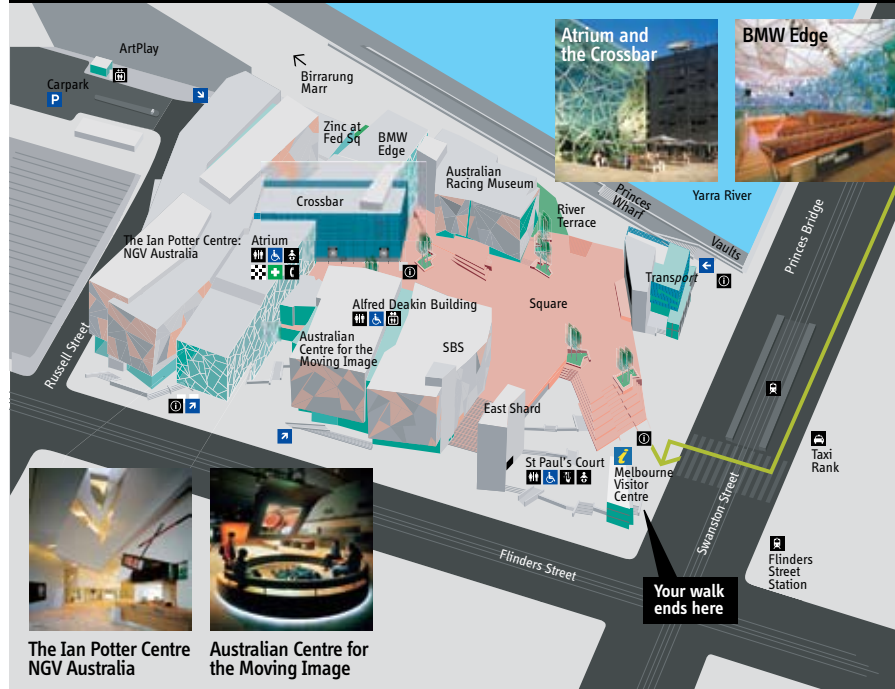
The Ian Potter Centre NGV Australia